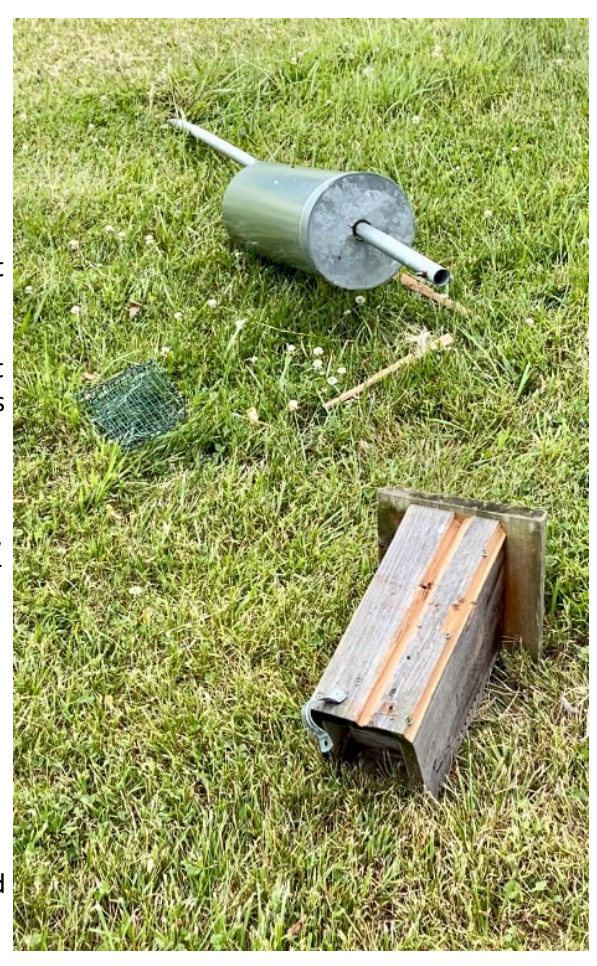
Nest box #46 with loss of 13-day old tree swallows to a Black Bear, photo dated June 12, 2023.

In the meantime, I am celebrating a generally successful bluebird trail season for 2023 as well as knowing (and accepting) the restoration of our Black Bear population in Virginia is progressing well. There is always next year to try again at those locations, and I'll hope for the best and carry on.