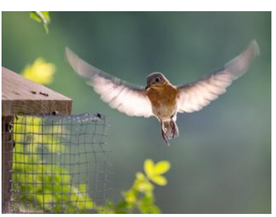
Beautiful blues at Ford's Colony in James City County.

Virginia Bluebird Society | Official Merchandise | Bonfire