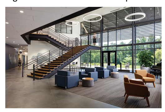
The Center at Belvedere, Charlottesville, VA