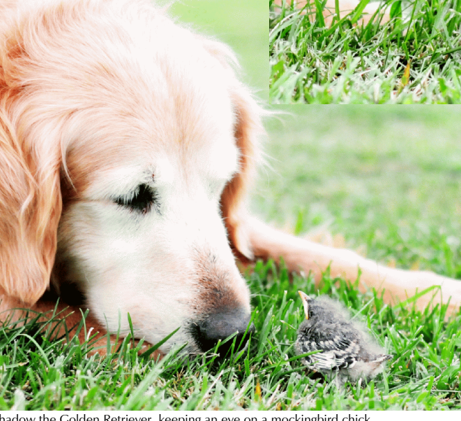
Shadow the Golden Retriever, keeping an eye on a mockingbird chick