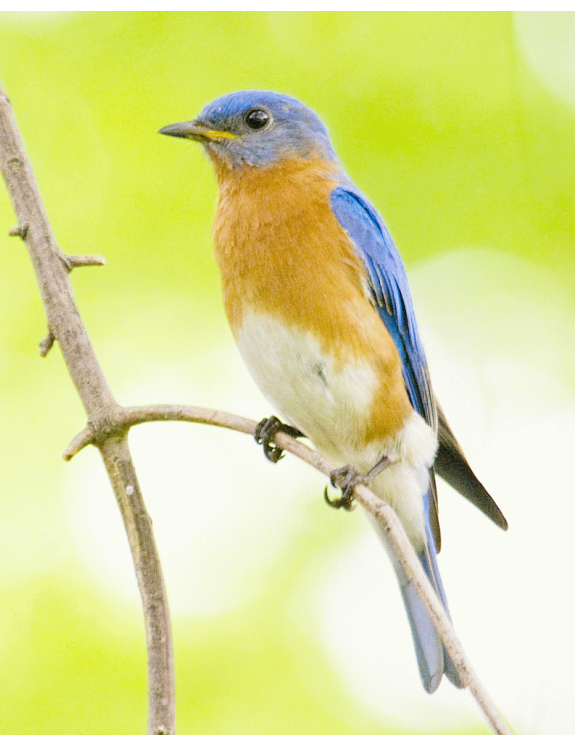
Male Eastern Bluebird