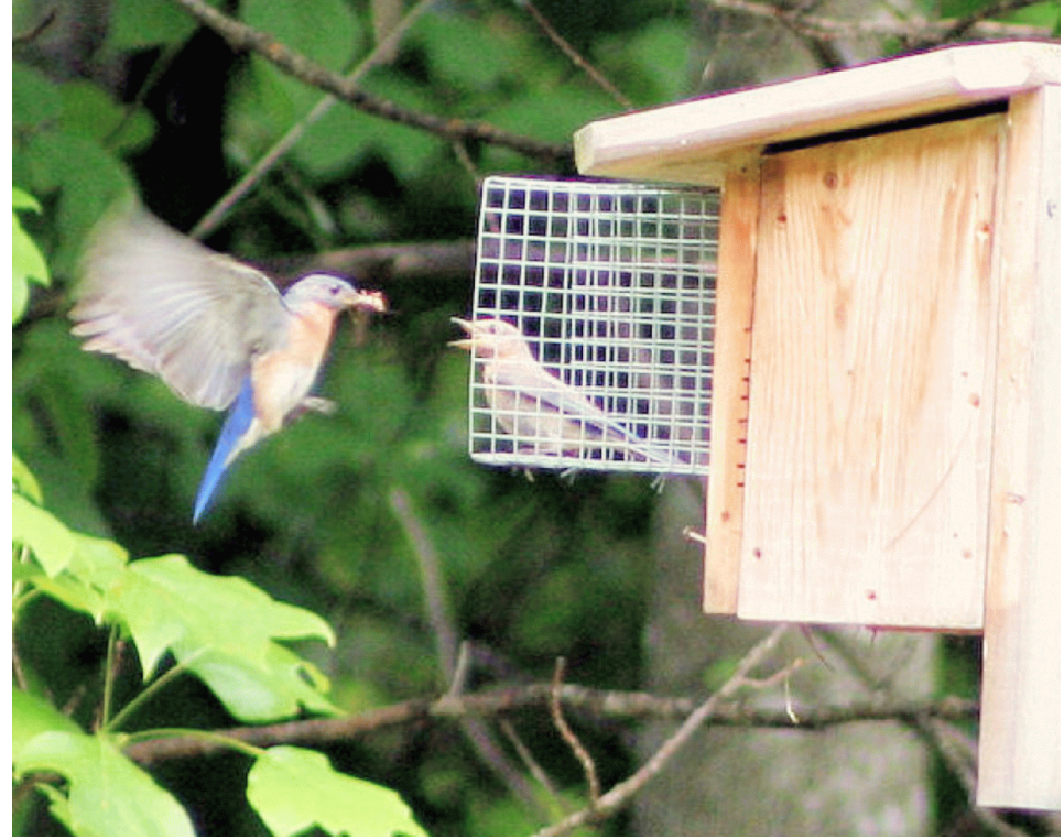
Male bluebird feeding female perched inside Noel guard