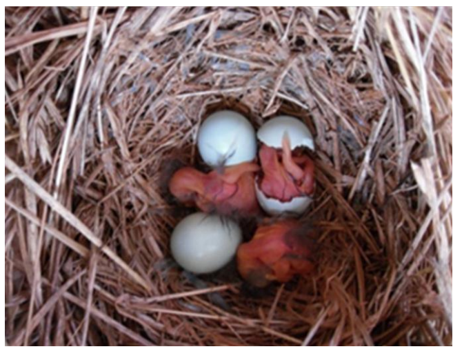
Bluebirds hatching June 22, 2011 (all five hatched and fledged)

instead fussed at us as we opened the box. When we peeked into the box realized that babies her were hatching. As one baby wiggled out of its egg, I was awestruck and ecstatic to have the privilege of witnessing this