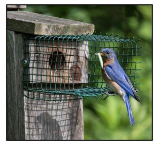
Virginia Bluebird Society