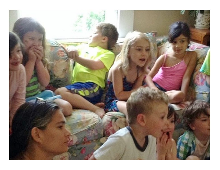
An egg started to crack.....