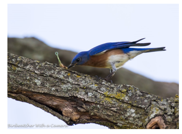
Above and Below: Here's Dad "relaxing" a caterpillar for immediate feeding. Then he delivers it and goes out for more – and more – and more.

Right: Here's mom in action. Isn't she lovely?