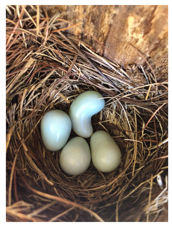
Clutch of odd-shaped eggs in Patrick County.

By Christine Boran, Woolwine House Bluebird Trail, Patrick County My bluebird trail in Woolwine, now in its 10<sup>th</sup> year of operation, had a late but very odd nesting. There was a first nesting that fledged 5 bluebird young on May 11. The rest of the summer yielded no second nesting at this nest box. Then, lo and behold, a new nest was built with a first egg laid on July 27. The egg clutch of four had three malformed-looking eggs with the strangest-shaped looking like an oversized kidney bean or one large piece of elbow macaroni! The other three eggs were misshaped — not the rounded oval shapes we monitors are accustomed to viewing in the nest.