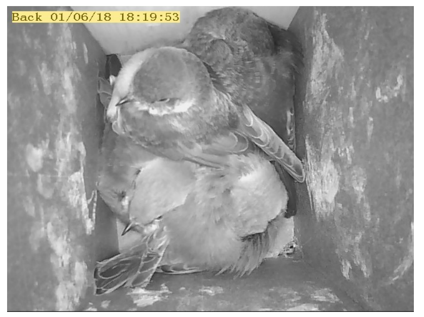
Nestcam photo of Eastern Bluebirds sheltering together in a nestbox last January.