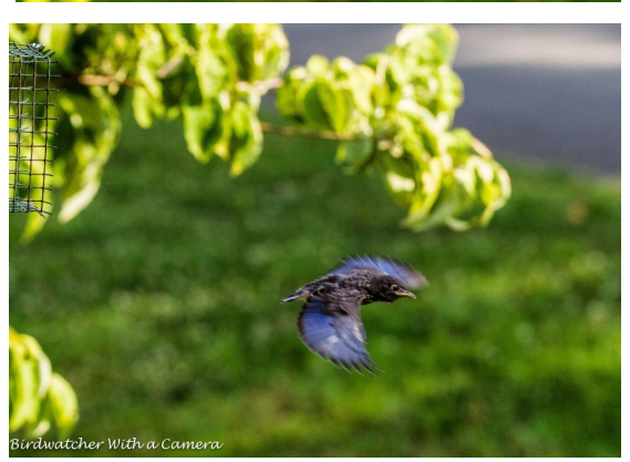
Left: Here's Jamie and Janie Bluebird on their first flight. They took off and actually flew up a small hill to a tree up there. There was another tree much closer to the box.