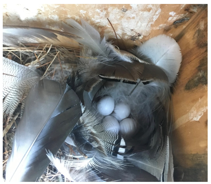
Tree Swallow nest and eggs