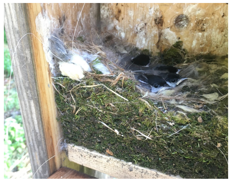
Carolina Chickadees in Fprt CF Smith Bluebird Trail nest box

The Fort CF Smith Bluebird Trail consists of 5 boxes in an Arlington County park that preserves the remnants of a Civil War fort. The fort was one of the many Union installations that protected Washington DC. Although we have not had a bluebird nest in the six years I have monitored, every year we fledge Carolina Chickadees and House Wrens, and for the past two years, Tree Swallows.