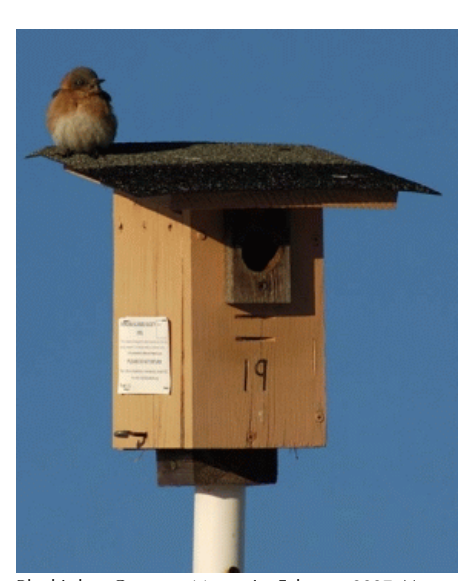
Bluebird on Compton Mountain, February 2007. Note the VBS educational label on the box.

To find a licensed wildlife rehabilitator for an injured bird, consult the March 2006 edition of The Bird Box or go to www.dgif.state.va.us. Remember that early intervention is important if the bird is truly injured, and only licensed rehabilitators are permitted to rescue wild animals.