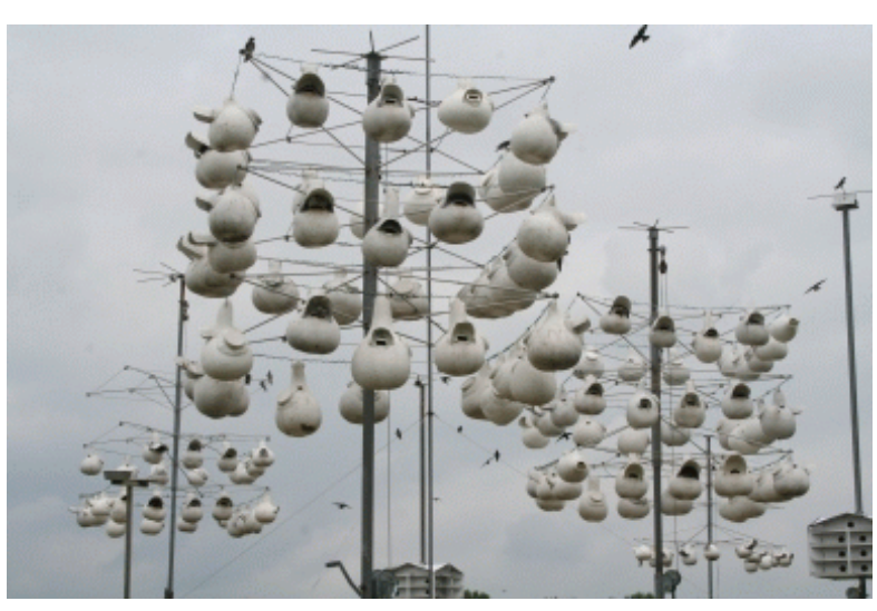
Display of gourd-like housing for Purple Matrins at last year's Purple Martin Field Day.

A: The PMCA and I have learned over the years that better nesting success is achieved with large natural gourds. All gourds must be painted white and otherwise properly prepared. At the Field Day I show people how to grow gourds, and how turn them into ideal martin housing. Natural gourds can be purchased from many sources, including the PMCA.