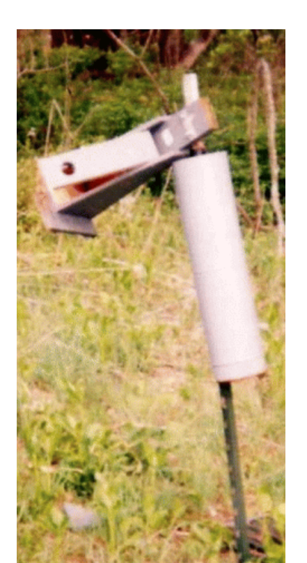
Nest box after bear attack.

Clutches Klytia Salcedo of Fairfax County in northern Virginia had two clutches start in March on her neighborhood trail. The clutch started on March 13 fledged three chicks from five eggs. The March 20 clutch hatched three chicks from four eggs, but none sur-