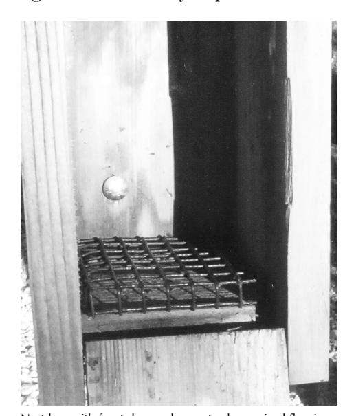
Nest box with front dropped open to show raised flooring.

ere in Orange County our farm fields are open to the winter winds, and the bluebirds sleep in our nesting boxes placed along pasture fences. A few winters ago, we lost several bluebirds in nest boxes. We spoke with other VBS members who had the same problem of many bluebirds sleeping in the same box and the ones on the bottom perhaps smothering. This may be because the weakest birds seek shelter first and end up on the bottom. We figured we would try to provide the bottom-most birds some breathing space.