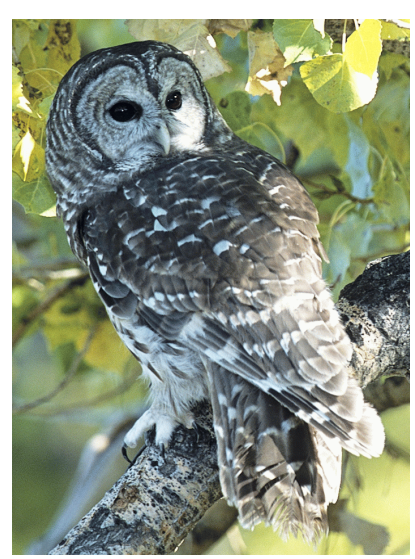
Barred Owl

Typically, no nest is built. The two to four round, white eggs simply occupy an empty cavity, and the single annual clutch takes 28-33 days to incubate. Unlike our bluebirds, which lay their entire clutch of eggs before beginning to incubate, owls will begin to incubate their eggs immediately after the first egg is laid. Therefore, should you see a brood of owlets, they are of all different sizes. If the prey is abundant, all will fledge. A paucity of