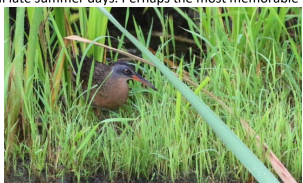
Continued on page 2

Left: Black Tern dive Right: Virginia Rail Ithaca, New York