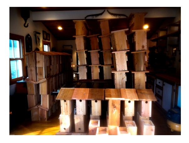
Stacks of finished boxes