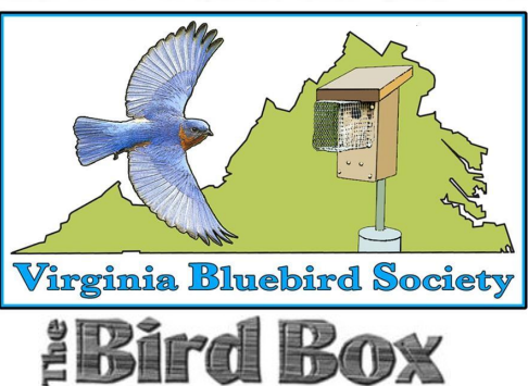
Virginia Bluebird Society