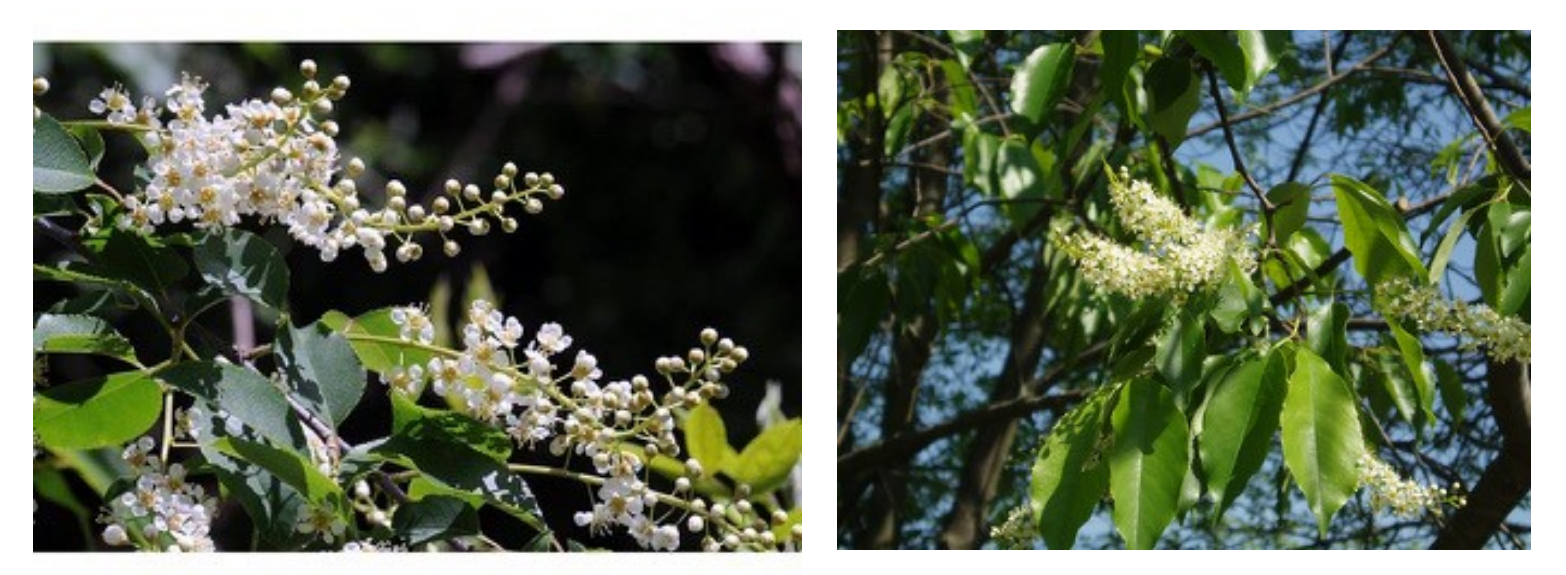
Above: Blossoms of Wild Cherry

and cherry wine) and has special value to native bumblebees and honeybees. In addition to the Eastern Tiger Swallowtail, Wild Black Cherry is the host plant for nine additional species of lepidoptera.