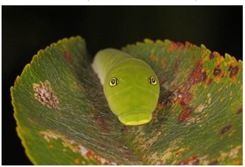
Eastern Tiger Swallowtail caterpillar

the course of the next three to four weeks, goes through five instars. From something that looks remarkably like bird droppings, it becomes fat, juicy, highly nutritious bird food.