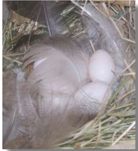
Black-capped Chickadee Moss, fine grass, lined with animal hair.