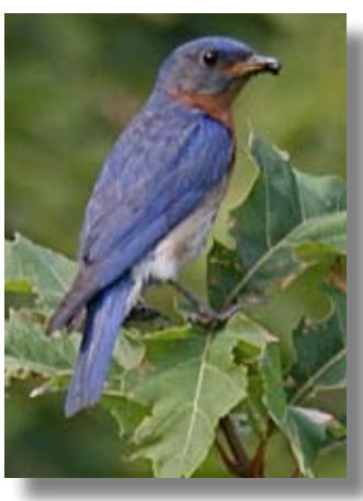
Male & female Eastern Bluebird